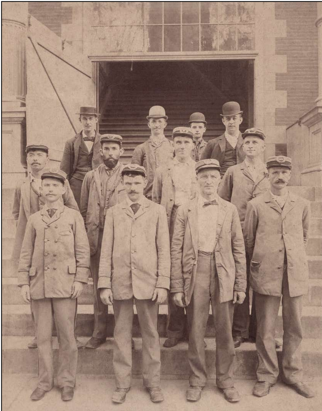
Stamford Post Office Force of 1891