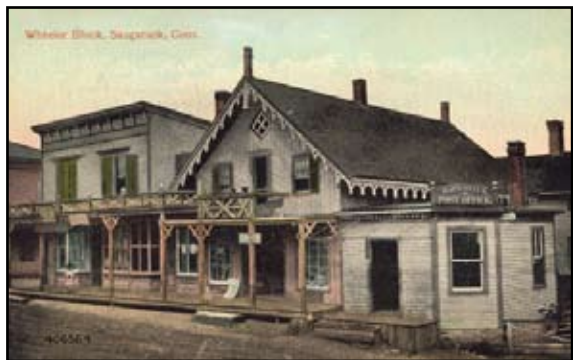
Saugatuck Post Office