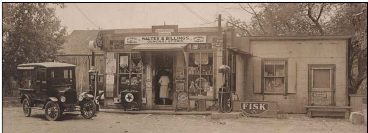
Wapping Post Office