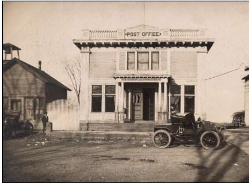
Portland Post Office