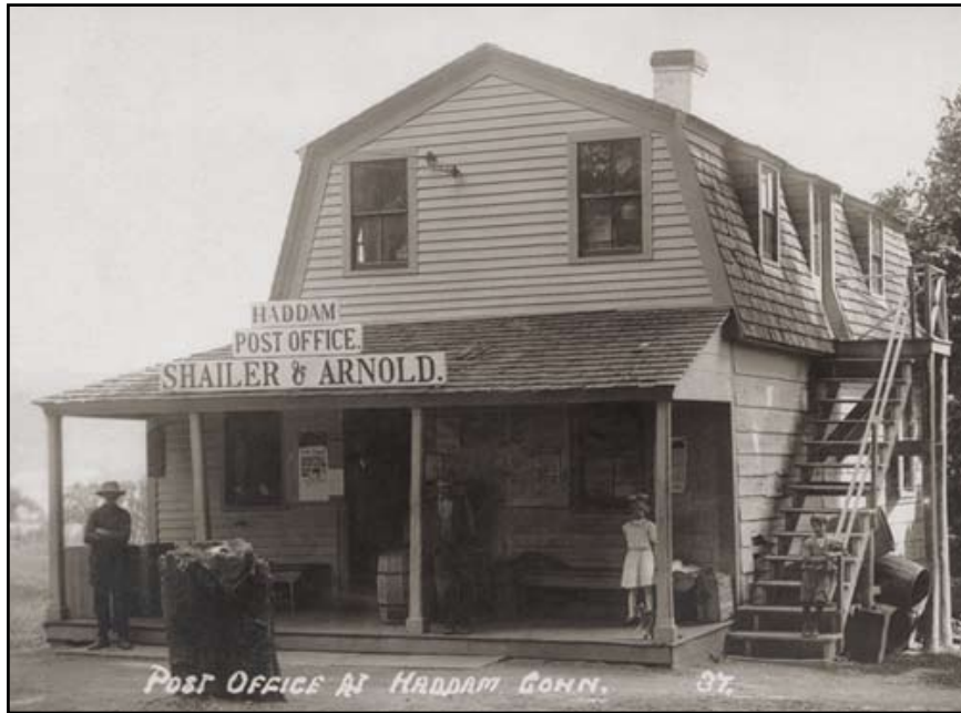
Haddam Post Office