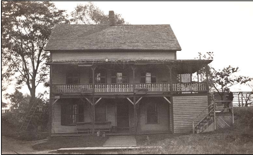
Massapeag Post Office