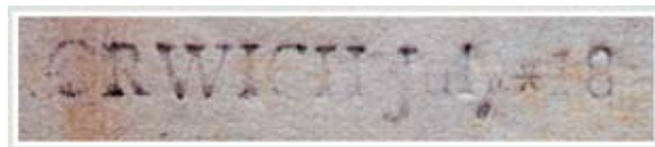
Greenwich GRWICH July *18 NYD Straightline