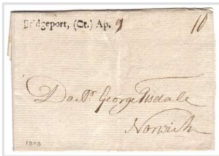
Bridgeport April 9, 1808 Straightline — 10¢ rate to Norwich