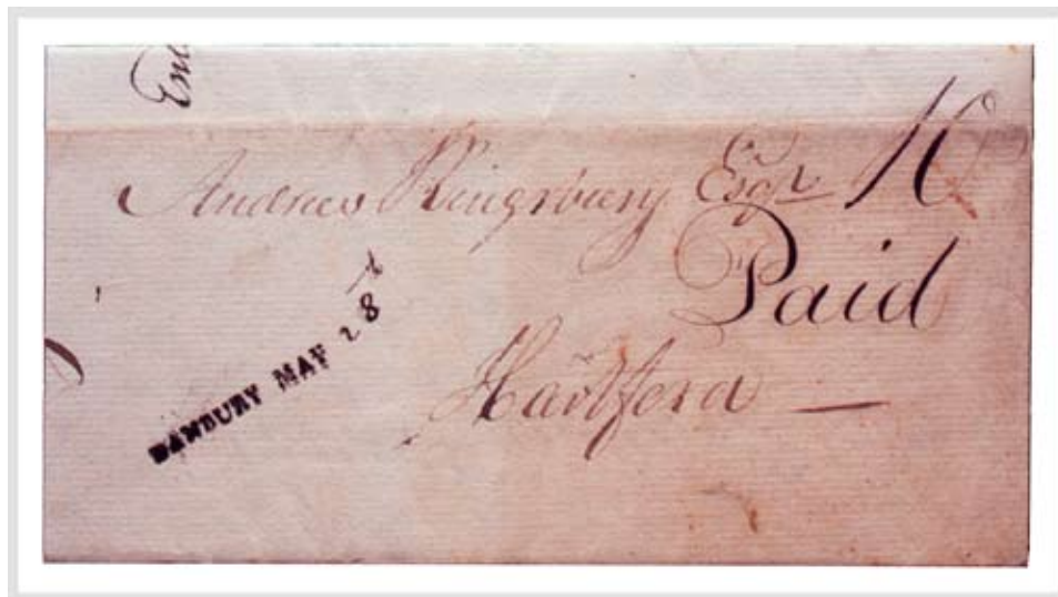
Danbury May 28, 1809 Straightline — 10¢ rate to Hartford