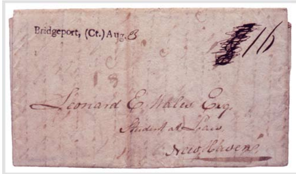
Bridgeport August 3, 1808 Straightline — 16¢ rate to New Haven, ex-Judge Fay