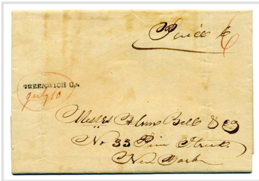
GREENWICH C,t. July 10, 1834 Straightline — 6¢ rate to New Haven