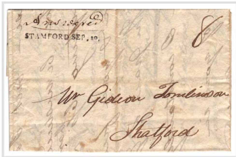
Stamford Sep. 20, 1802 Straightline — 8¢ rate to Stratford (W.T. Crowe Collection)