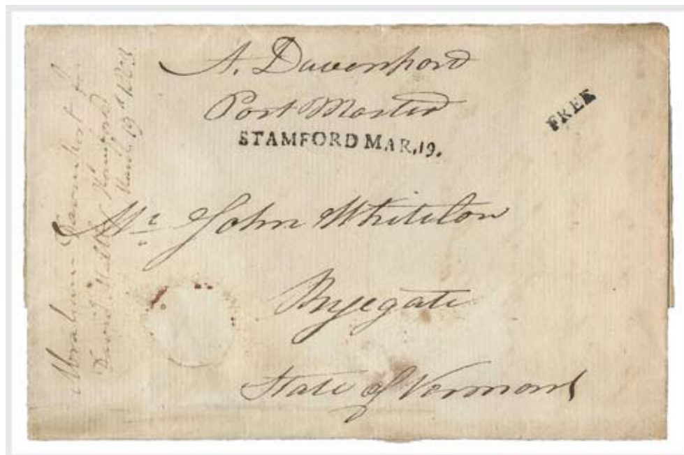
Stamford March 19, 1803 Straightline — PMFF to Rygate, VT (RA Siegel Auction Galleries)