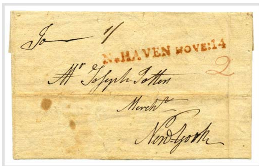
New Haven N*HAVEN NOVE:14 1775 Straightline to New York.