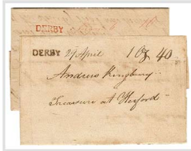
DERBY Straightline in Red (1799) and Black (1800) (John Olenkiewicz Collection)