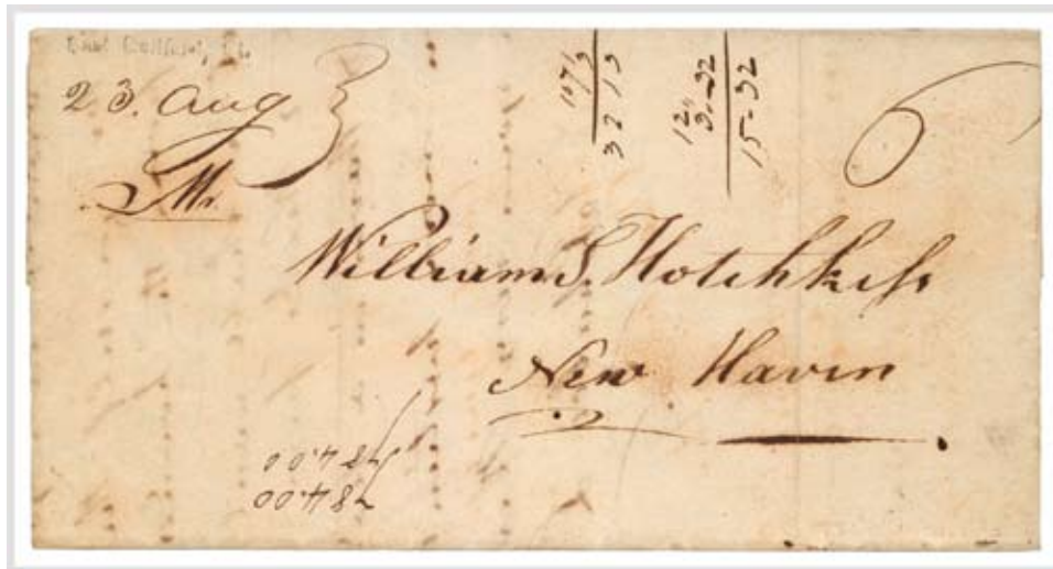
East Guilford August 23, 1821 Straightline — OKU, 6¢ rate to New Haven