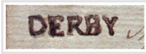
Derby Straightline in use 1799-1801