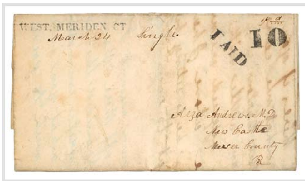
WEST, MERIDEN. CT March 24, 1846 Straightline — pre-paid 10¢ rate to PA