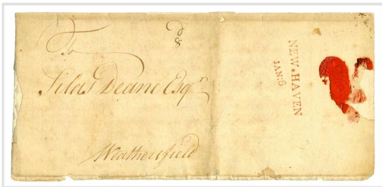
New Haven January 6, 1775 — double weight rating for under 60 miles, to Patriot Silas Deane, Wethersfield Earliest Known New Haven Straightline and Only Known Example of the NEW*HAVEN type handstamp