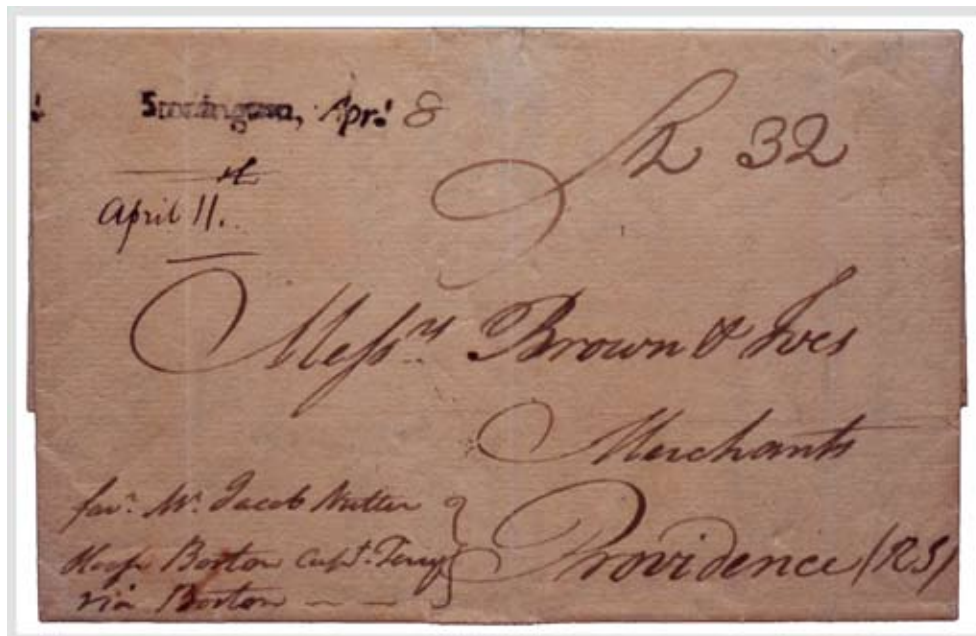
Stonington, Apr. 8, 1803 Straightline — letter written from Buenos Aires to Providence