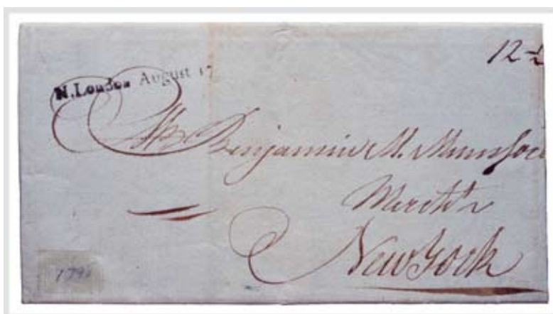
New London N.London August 17 1798 Straightline — 12½¢ rate to New York