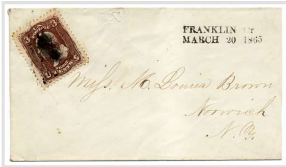
FRANKLIN Ct/ March 20, 1865 2L Straightline — oxidized dark brown red 3¢ 1861 to Norwich, N.Y.