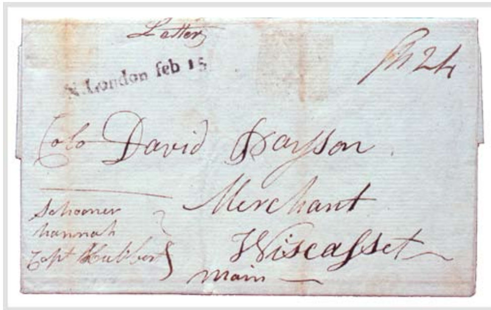
New London N.London feb 15 1799 Straightline on letter from Tobago to Maine