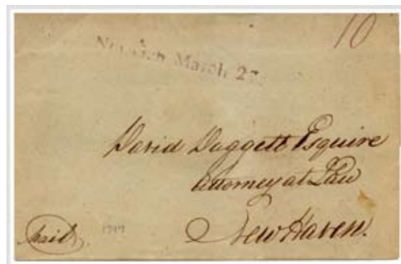
Norwich March 27 1797 Straightline — 10¢ rate to New Haven (Robert Manke Collection)