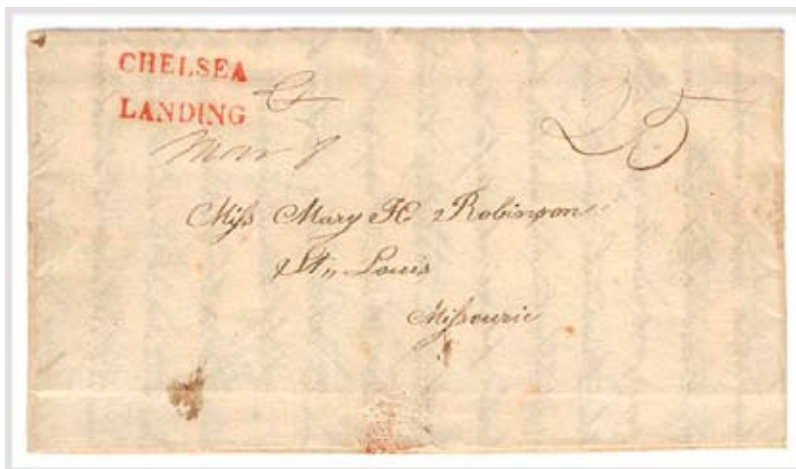
CHELSEA/LANDING March 8, 1824 2L Straightline 25¢ rate to St. Louis (John Olenkiewicz Collection)