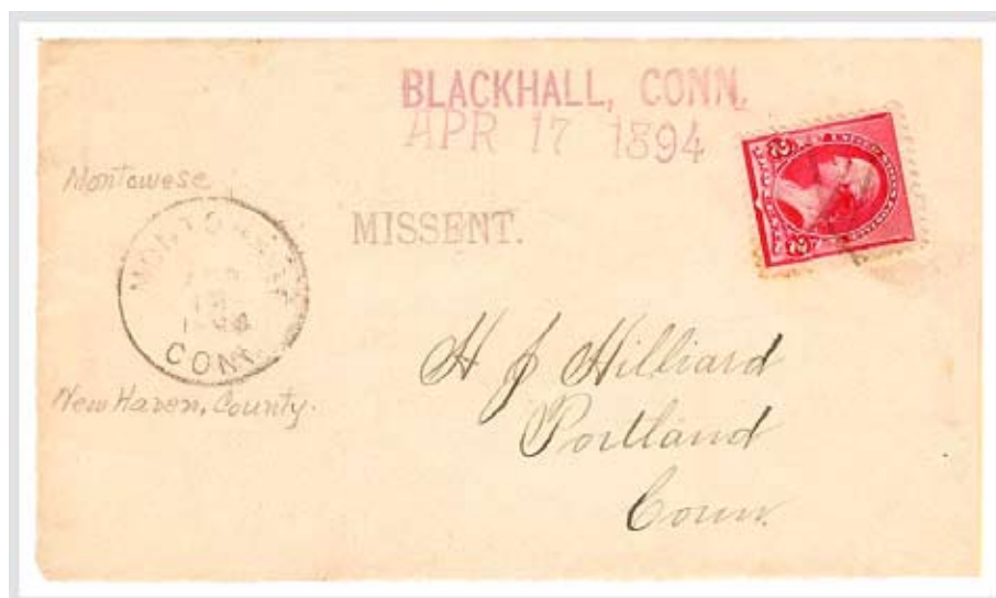
BLACKHALL, CONN. April 17, 1894 Straightline — Missent to Montowese instead of Portland, CT; Handstamp used temporarily after Post Office fire (John Olenkiewicz Collection)

BLACKHALL, CONN. April 6, 1894 Straightline - used only in that year (Robert Manke Collection)