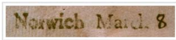
Norwich March 8, 1793 Straightline to Hartford