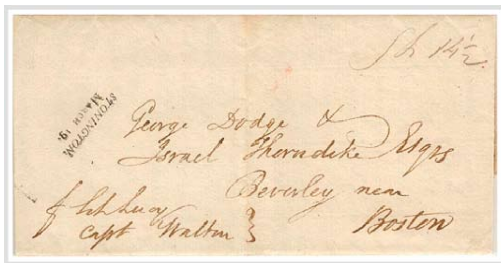
STONINGTON, March 19. 1800 2L Straightline — 14½¢ rate Ship rate Boston